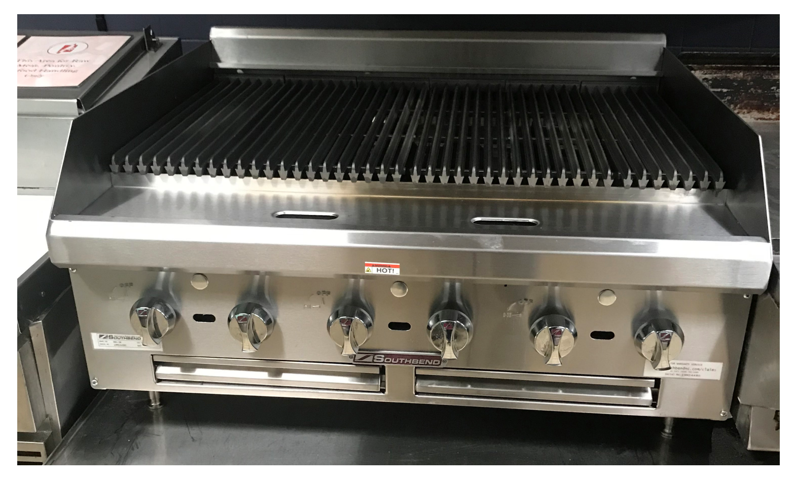
TD's service technicians worked closely with UTPB and Chartwells to identify the source of equipment issues while also repairing or replacing necessary equipment.

kitchen on the campus, and much of the equipment was not functioning efficiently.